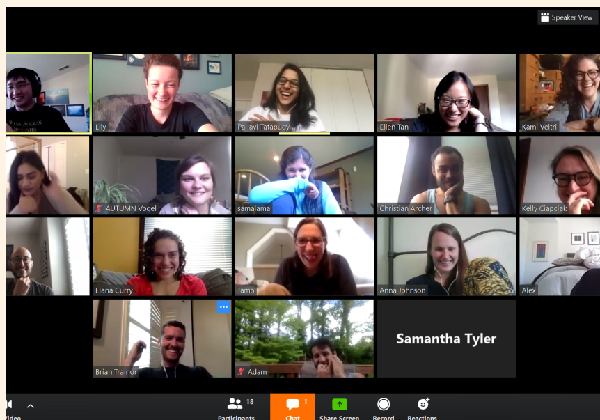
Laughing together in peer-led group improv