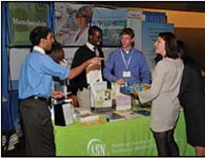
AMSA's 59th Annual Convention was held in Washington, D.C. Premedical and medical students, international medical students, residents and interns, physicians and other activists from across the country assembled for the five-day conference of innovative workshops and organizational policymaking relating to top health care issues.